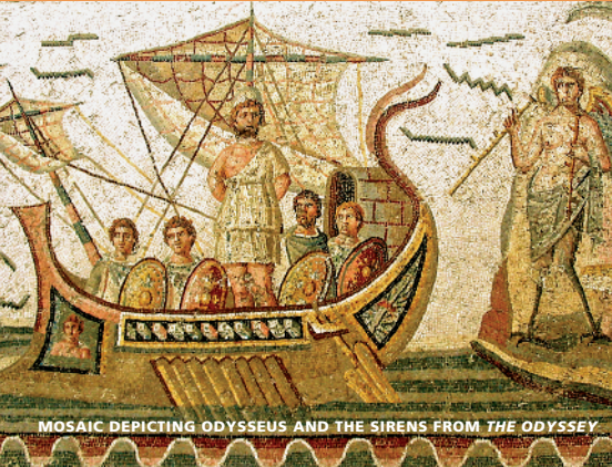
MOSAIC DEPICTING ODYSSEUS AND THE SIRENS FROM THE ODYSSEY

HUMANITIES WEST Exploring History. Celebrating the Arts.